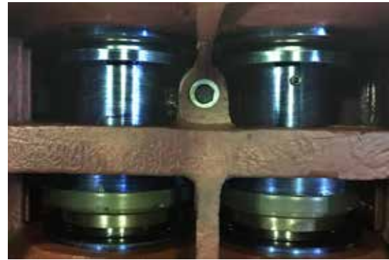
Components (main shafts) for palm oil extract